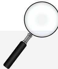
Crime Scene Investigation