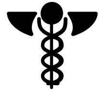
Medical Careers & Health Systems