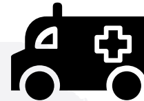
Emergency Medical Responder