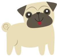
Animal Health Care